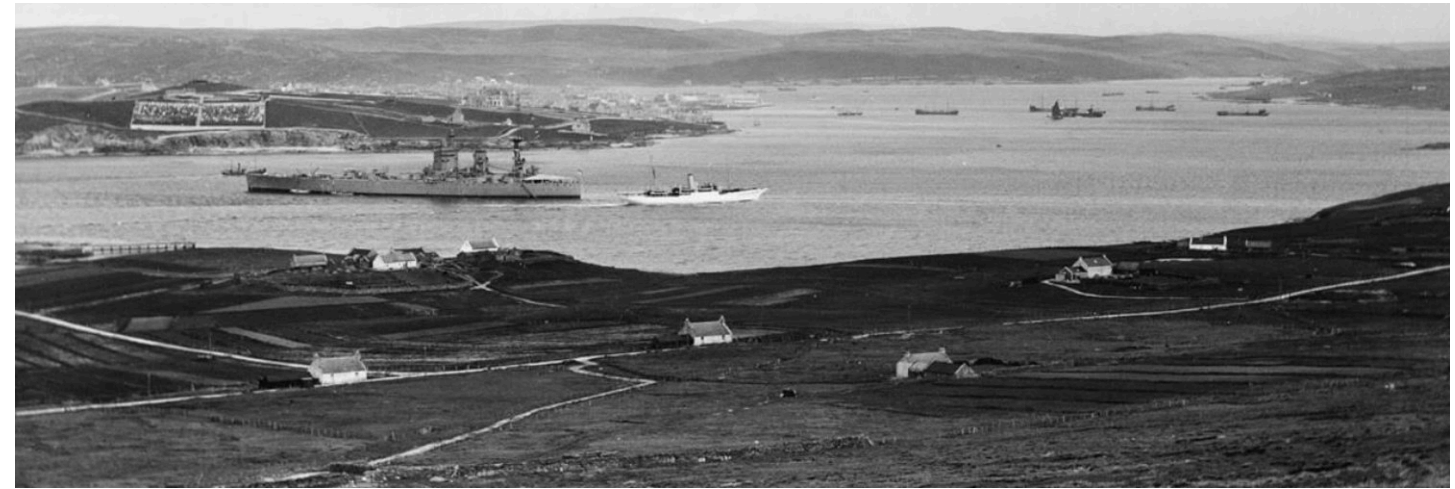
H.M.S. Rodney passing the St Sunniva 1932.

Bressay Heritage Centre is open 1 st May to 28 th September on Wednesdays, Fridays and Saturdays 10am - 4pm.