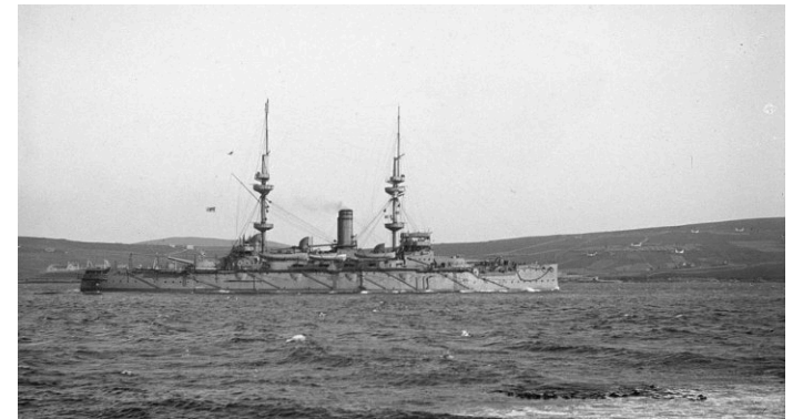
H.M.S. Illustrious 1904. This Royal Navy visit was in response to a number of German Navy vessels visiting Lerwick in July 1904.