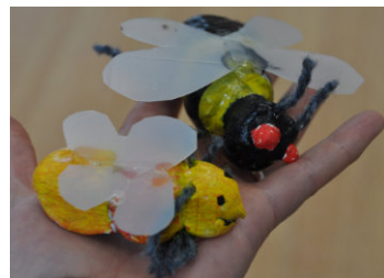
Wednesday Social Group, and their handmade bees!