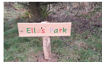
See page 4 for news from Ella's Park.